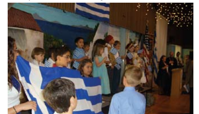
(Greek Independence Day with Sunday School participation)

Our annual Greek Independence Day Luncheon on Sunday, March 23rd was another success. This year not only was our hall covered with Greek flags but we got the Sunday school kids involved. They did a great job singing and reciting Greek poems dedicated to our Independence Day. All the proceeds from this luncheon support the Dan Anthony Memorial Scholarship Fund.