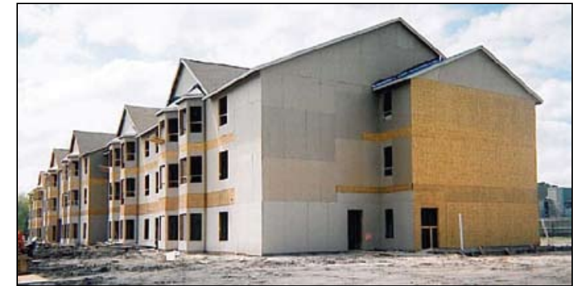
Penelope's Place, the Achaia Chapter's HUD complex, beginning to take Shape!