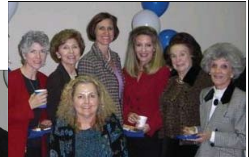
HAPPY BIRTHDAY!!! Sisters from Nester Chapter celebrate the 71 st birthday of the Chapter's founding on February 26th, 1937.