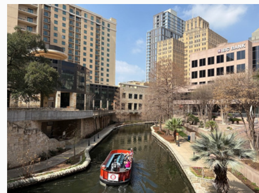
View from Host Hotel