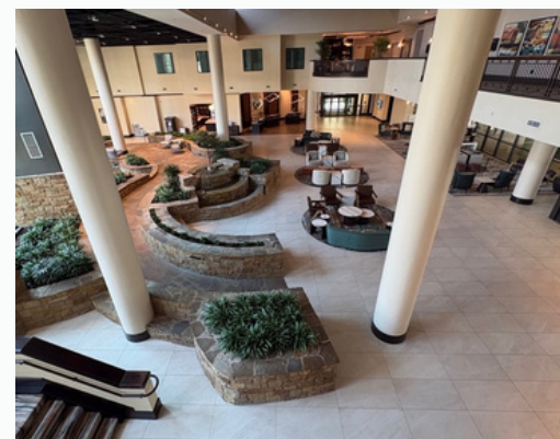
Lobby Space at Host Hotel